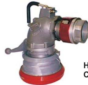
64800 HYDRANT COUPLER

* Applicable to all Carter API Couplers including model numbers 60600, 60700-1, 61525, 64702, 64800, 64801, 64802, 64803, 64900, 64901 & 64902