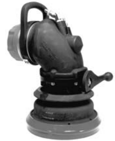
60700-1 HYDRANT COUPLER